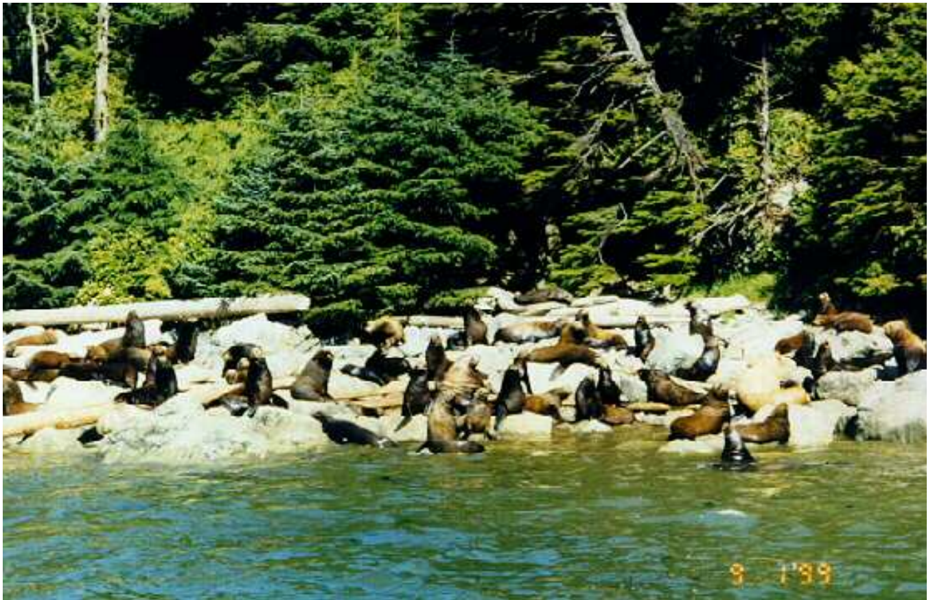
A colony of sea lions