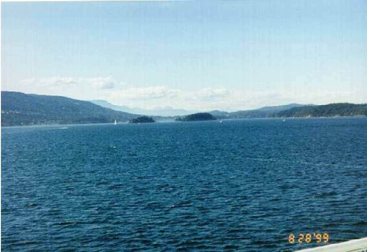
From Ucluelet (on the west coast of Vancouver Island) we took an excursion boat out to Barkley Sound