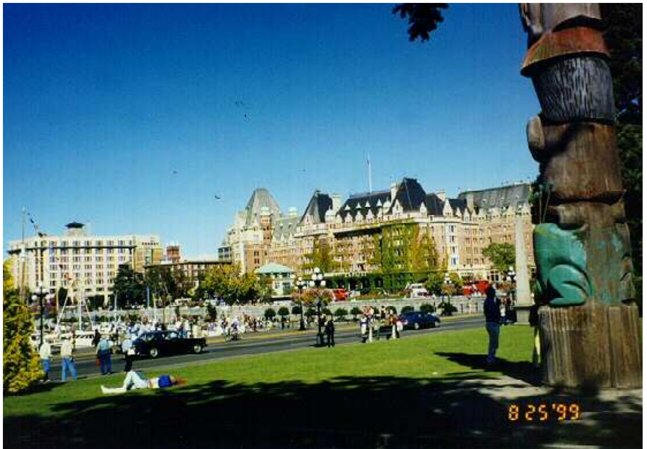
Inner harbor Victoria B.C.

Lunched on Caesar salad at the Empress Tuesday and at an attractive cafeteria at the Buchart on Wednesday. Really enjoyed all the acres of flowers—many mums, impatiens, autumn sedum, zinnias, etc., this time of year-- but not the constant Japanese picture-taking folks! In the eve, we wandered around the international district and chose from so many restaurants with great ethnic food—ate at Jr.'s Indian Food place.