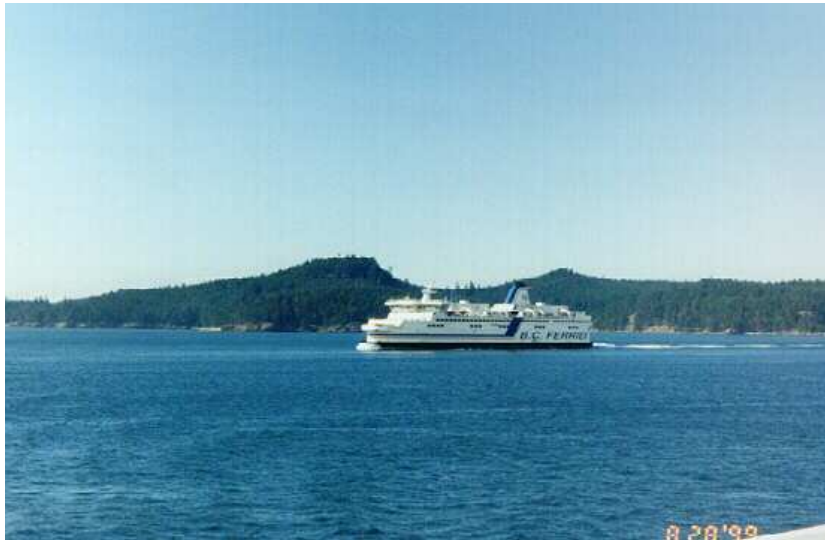
BC Ferry in Active Pass

however, and most we spotted were too distant to identify. Stopped off at a visitors center and got info on places to stay—decided on the Dominion, an older hotel near the center of town. Price was $89 Canadian, which included most of dinner. Signed up for an additional day and they threw in a hearty breakfast, as well.